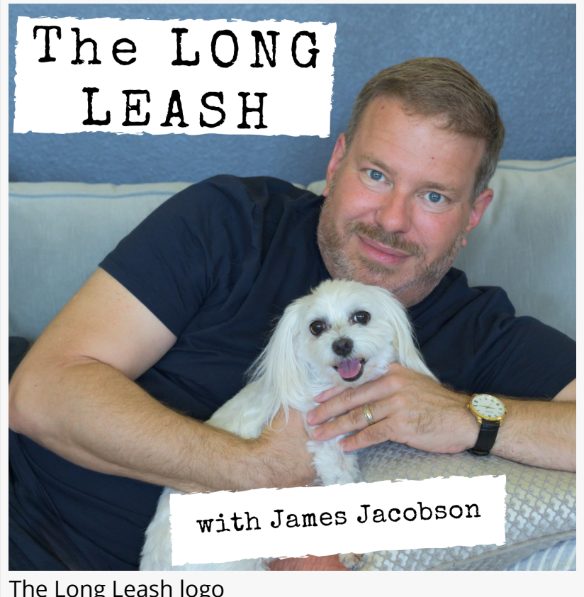
The Long Leash logo